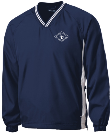
Navy w/ White Accents

Cool, windy days are no match for this soft, water-repellent wind shirt. With tipping on the collar and at the gussets, it boasts simple lines, a quiet hand and true team-oriented style.