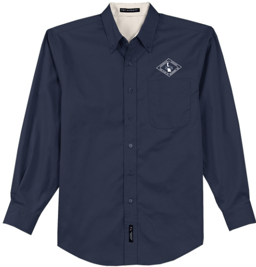
Navy Blue / Stone