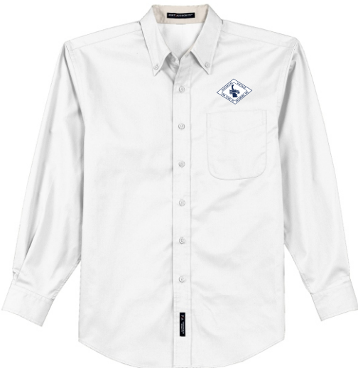
White / Stone

Machine wash warm with like colors. Only non-chlorine bleach when needed. Tumble dry low. Warm iron if necessary.