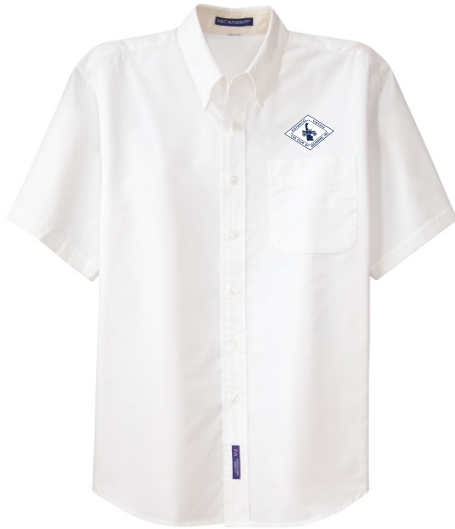
White / Stone

This comfortable wash-and-wear shirt is indispensable for the workday. Wrinkle resistance makes this shirt a cut above the competition so you and your staff can be, too.