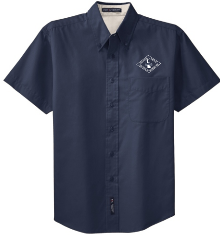
Navy Blue / Stone