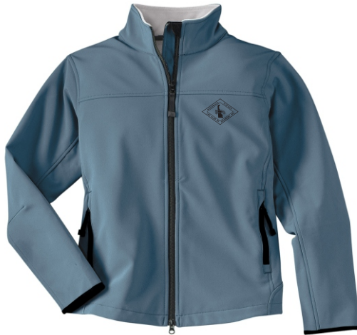
Atlantic Blue / Chrome

One of our most popular jackets, the Glacier ® is constructed from a polyester stretch woven shell, which is then bonded to polyester microfleece with an added laminate film insert to repel water. The result is a wind-resistant, water-resistant jacket with stretch that's perfect for corporate or weekend wear.