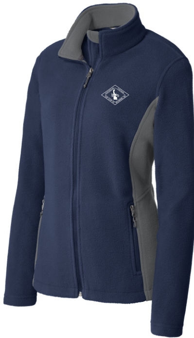
Navy w/ Battleship Grey

Side colorblocking makes this midweight fleece jacket particularly striking. Extra soft, it delivers comfortable warmth at a very competitive price.