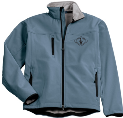
Atlantic Blue / Chrome

One of our most popular jackets, the Glacier ® is constructed from a polyester stretch woven shell, which is then bonded to polyester microfleece with an added laminate film insert to repel water. The result is a wind-resistant, water-resistant jacket with stretch that's perfect for corporate or weekend wear.