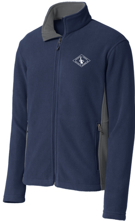
Navy w/ Battleship Grey

Side colorblocking makes this midweight fleece jacket particularly striking. Extra soft, it delivers comfortable warmth at a very competitive price.