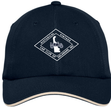
Navy w/ White Accent