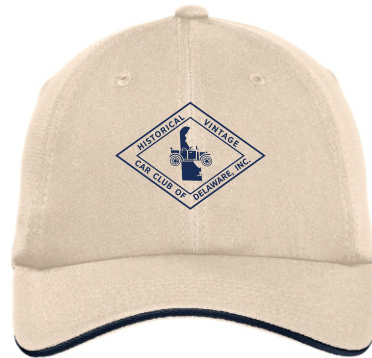
Stone w/ Navy Accent

An exceptional combination of breathability and moisture wicking, this cap features a quick-drying CoolMax sweatband. The sandwich bill adds character and is a great complement to any logo.