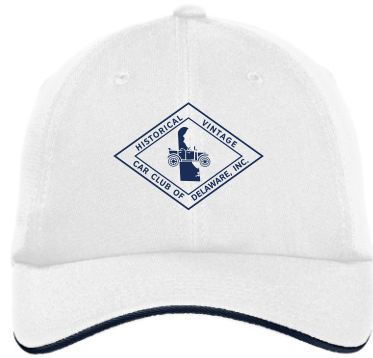
White w/ Navy Accent